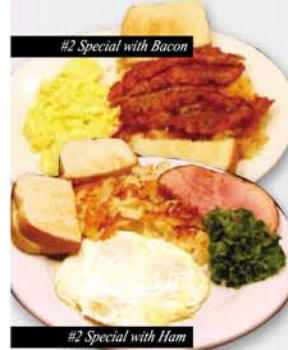
#2 Special with Bacon