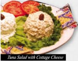
Tuna Salad with Cottage Cheese