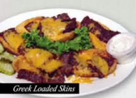
Greek Loaded Skins