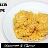
Macaroni & Cheese