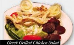
Greek Grilled Chicken Salad

CHICKEN SALAD Fresh crisp lettuce, cucumber, tomato and croutons 8.29