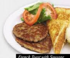
French Toast with Sausage