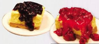
Cheesecake with Cherries