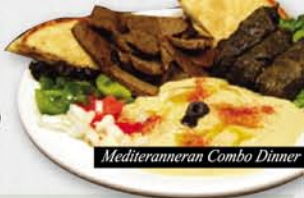
Mediterranean Combo Dinner

OPEN FACED HOT TURKEY Fresh sliced turkey over bread, topped with roasted turkey gravy 10.99